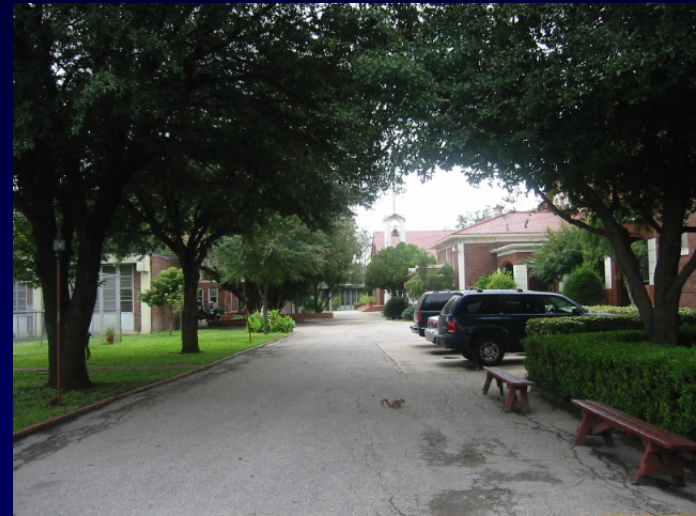
The campus and grounds