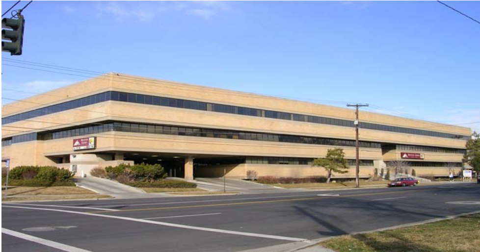
Cornerstone Counseling Center, Downtown Salt Lake City